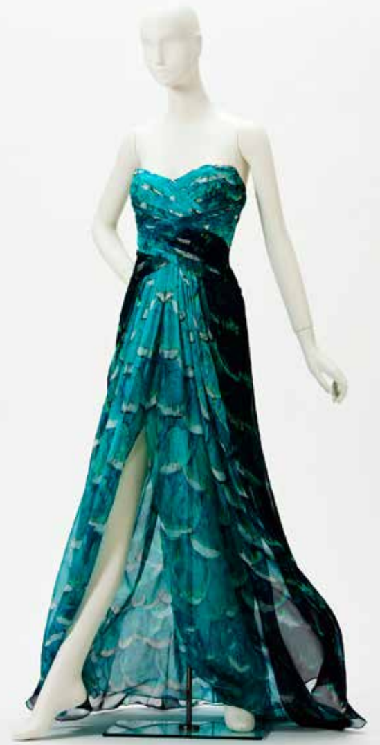
Monique Lhuillier (Filipino, born 1971), Evening Dress, Spring, 2013. Digitally printed silk chiffon. Gift of Monique Lhuillier.