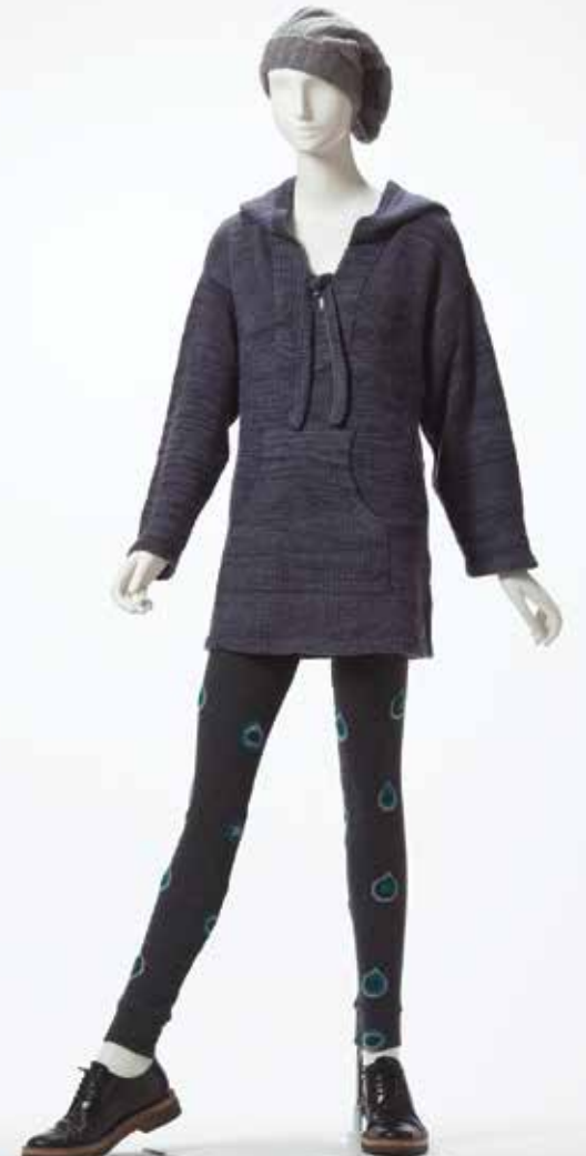
The Elder Statesman (American brand, founded 2007), Sweater, leggings and hat, Fall 2014. Cashmere. Lent by The Elder Statesman.