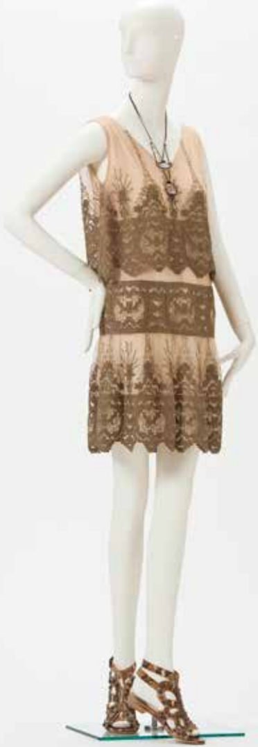
Anna Sui (American, born 1964), Dress, Spring 2014. Polyester tulle with cotton and nylon embroidery. Lent by Anna Sui.